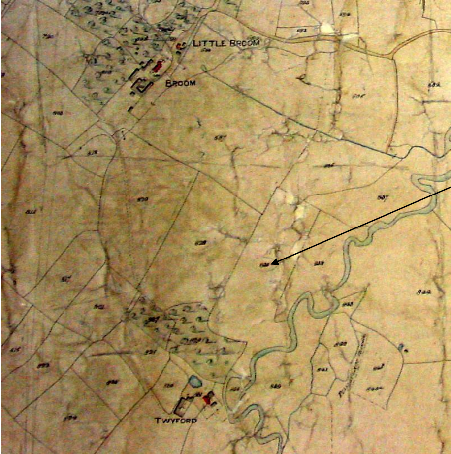
Tithe Map, HRO copy.