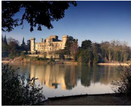
View from the lake at Eastnor Castle, Ledbury

British Red Cross fund-raisers are busy organising this year's Great Spring Garden Event, which will take place in the glorious surroundings of Eastnor Castle on 28 April 2010, 10.30am - 4.30pm. Visitors will also be able to enjoy access to the Castle itself.