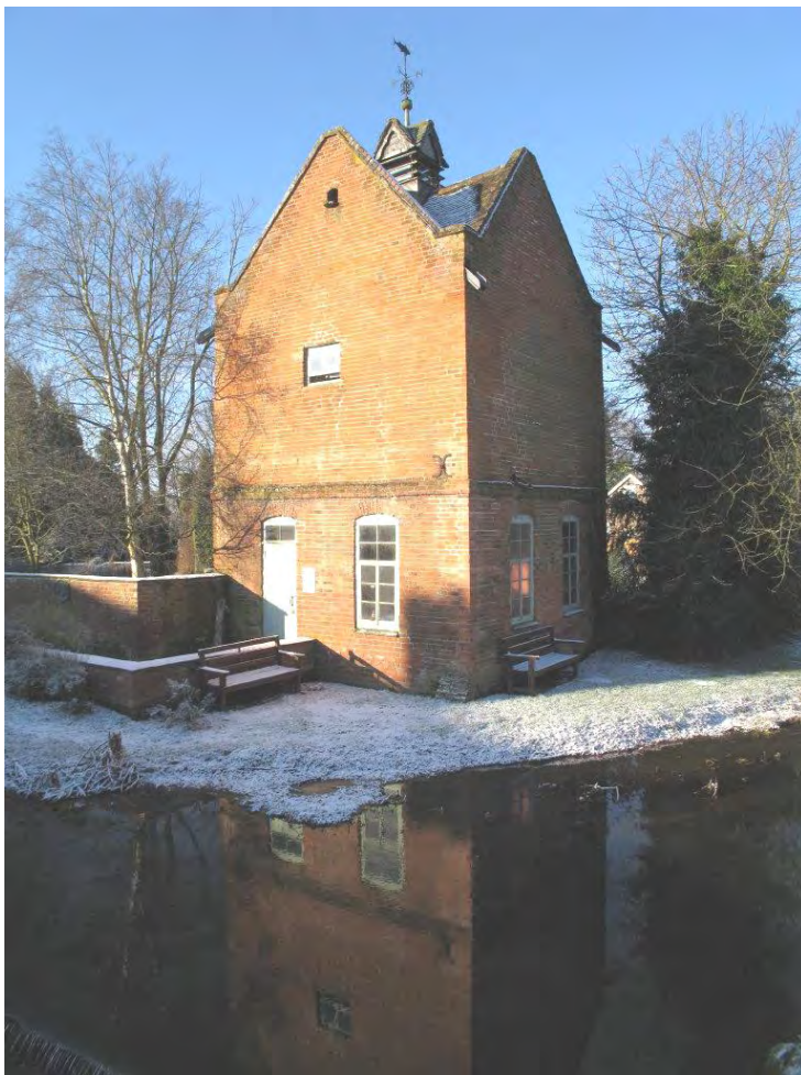
It's still cold in March! Photo by James MacRae, March 2010