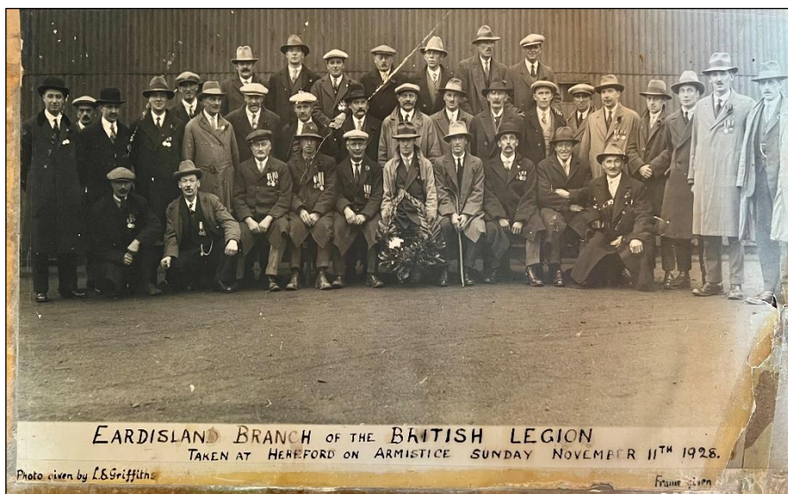
It is dated November 11 th 1928.